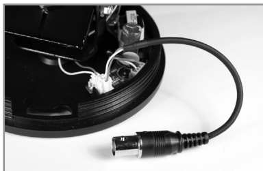
Secondary Video Output & Cable.

The VTD-C510 is equipped with a Secondary Video Output for ease of setup and adjustment. A 6" cable is included with the camera.