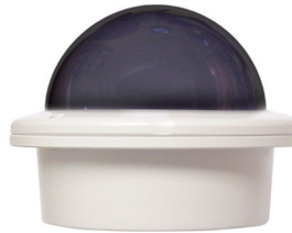
Removable Dome Ring For Recessed Mounting Applications

The VTD-VPH Vandal Resistant Dome Camera is a smaller, more attractive camera ideal for use in commercial or residential applications. It measures only 5" in diameter and comes with a 24 Volt AC power input for easy integration with standard cameras and power systems. Versatile mounting and lens options allow you to achieve perfect video images in virtually any environment. All VTD-VPH domes feature Sony Super-HAD and/or Ex-View Technology with Hi-Resolution of 480 Television Lines.